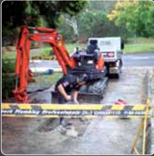
Our way - Trenchless Technology