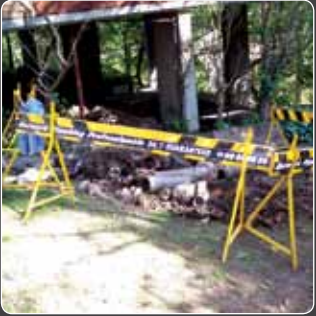
The old way...